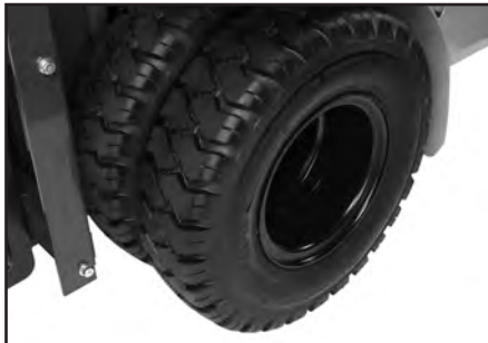
Wide, dual or solid pneumatic tire options available.