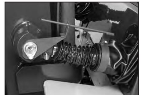
Tilt cylinder boots or tilt cylinder covers for protection against dirt and dust. Mast tilt gauge provides visual indication for vertical alignment of mast.