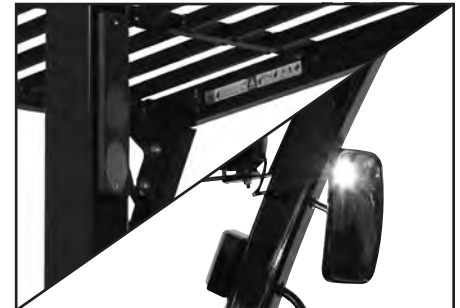
Brake lights, turn signals, and backup lights or large size rearview mirrors.