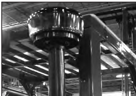
Air intake pre-cleaner for extended filter life.