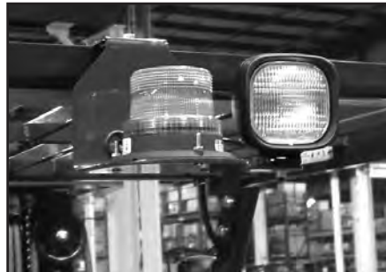
Rear work light, or rear strobe light, for enhanced awareness.