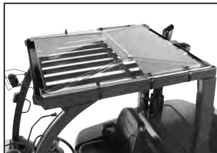
Polycarbonate rain guard, with water diversion channels, partially opaque for protection from the sun.