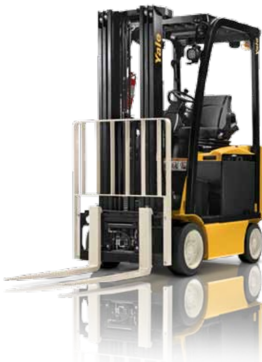
Truck shown with optional equipment.